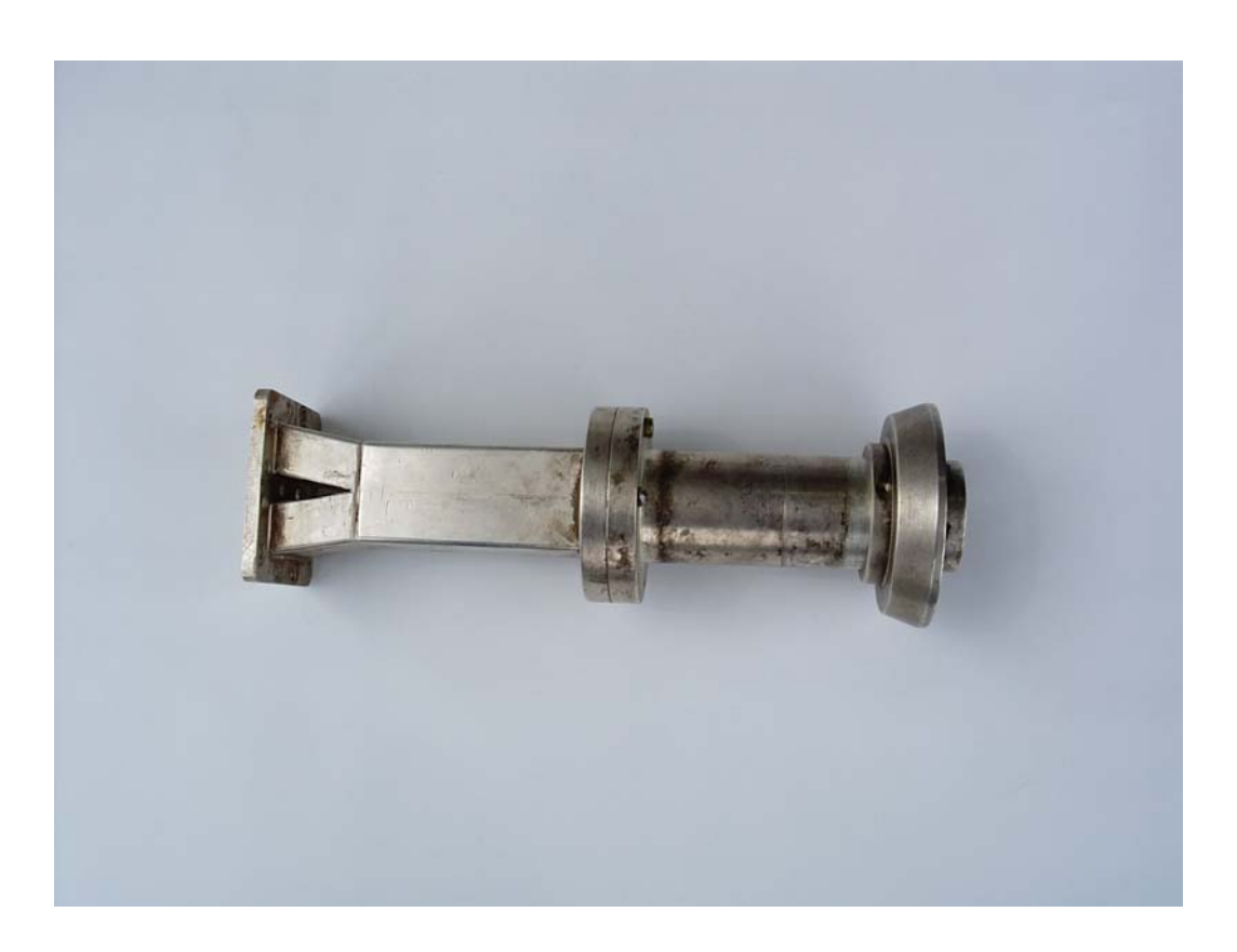
Septum feed 5.7 GHz OK1DAI

At the same time, members of radio club OK1KIR were looking for a feed suitable for EME applications at 5.7 and 10 GHz. Kysela designed these septum feeds for both bands, probably based on IEEE references. A feed for 10 GHz, designed by Kysela, was first built by Antonin, OK1DAI, in early 1993 with construction of the 5.7 GHz feed beginning in the later half of the same year. Feeds for other amateur radio bands have been designed based on these two examples. Antonin published technical information on the 5.7 and 10 GHz feeds in the French magazine "HYPER" for the 1998 EME conference in Paris. Additional information on septum feed was published by Zdenek, OK1DFC, on a CD ROM prepared for the 2002 EME conference in Prague.